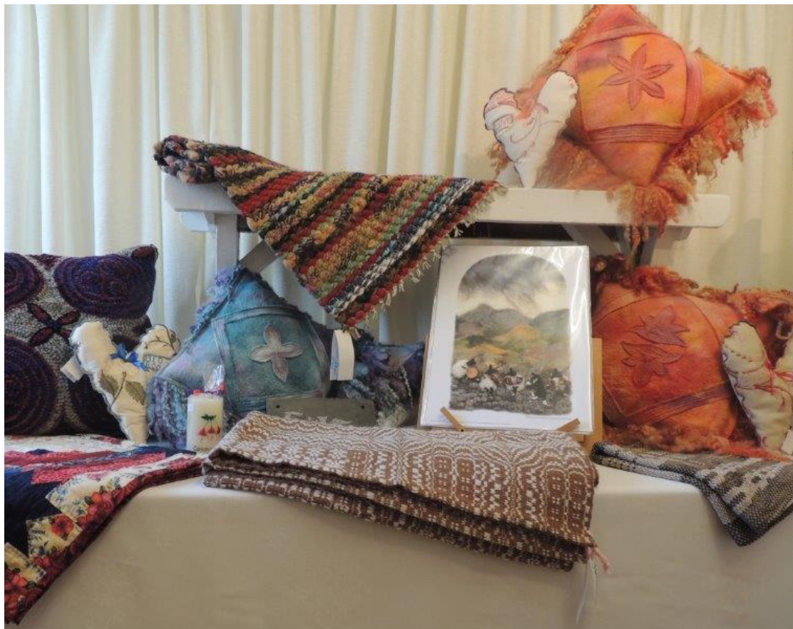
Some of the Items on Display at the HQ Craft Shop

€10 per class. Contact Siobhán: 087 234 9183